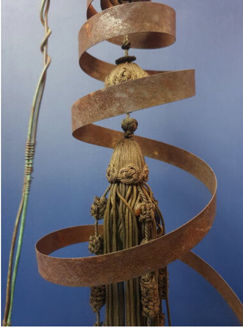
FIGURE 8A Elsa von Freytag-Loringhoven, Limbswish , c. 1917–1919. Metal spring, curtain tassel, and wire mounted on wood block. Height with base 55.1 cm MARK KELMAN COLLECTION. VENICE BIENNALE EXHIBITION PHOTOGRAPH BY JENNIFER ASHBY, VIA TWITTER, 29 APRIL 2022