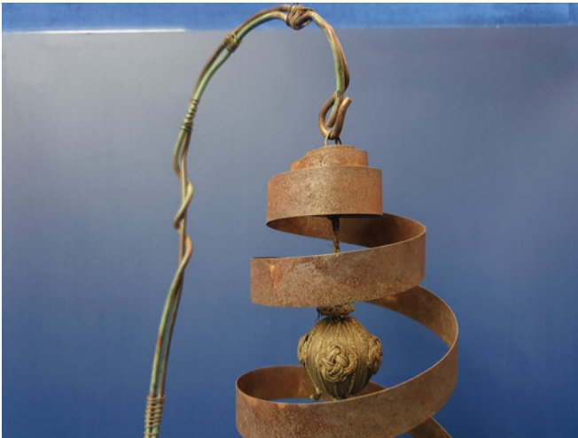
FIGURE 8B Elsa von Freytag-Loringhoven, Limbswish , c. 1917–1919. Detail of tassel head MARK KELMAN COLLECTION. VENICE BIENNALE EXHIBITION PHOTOGRAPH BY JENNIFER ASHBY, VIA TWITTER, 29 APRIL 2022