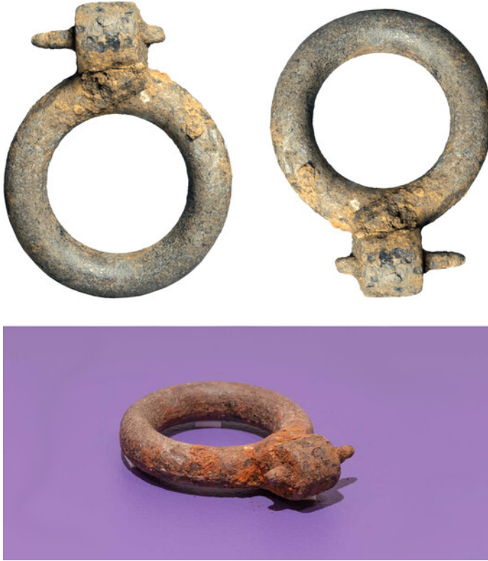
FIGURES 5A–C Elsa von Freytag-Loringhoven, Enduring Ornament , 1913. Found object, metal ring. Height 10.5 cm. Mark Kelman Collection, New York. Clockwise: a) Typical positioning of object in photographs; b) Digital rotation of Figure 3a by 180 degrees to show the Venus symbol with cross at the bottom; c) The Baroness Elsa Project , exhibition photograph 2021 by Justin Wonnacott

A) PHOTOGRAPH COURTESY MARK KELMAN; C) COURTESY OF CARLETON UNIVERSITY ART GALLERY, OTTAWA.