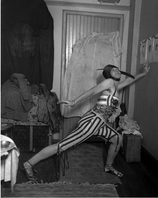
FIGURE 1 Elsa von Freytag-Loringhoven in her Greenwich Village Studio, 7 December 1915