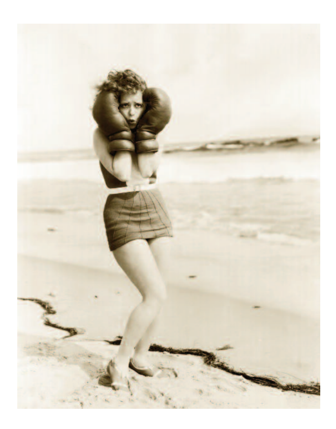
Figure 4 Actress Clara Bow, the 'It Girl', poses on a Malibu beach, 1927.

In another remarkable photograph (see Figure 4), Bow holds both gloved hands to her head, with her upper body creating the silhouette of a pear-shaped punchball. Thus, in a curious way, she now personifies the punchball, with her face expressing mock fear and horror. Standing on a Malibu beach with the sea behind her, her angled elbows point straight downwards while the ribs on her maillot's skirt run upwards. Both sets of lines converge on her solar plexus, a spot of high vulnerability in boxing. In contrast to this foregrounding of fragility is the remarkable confidence with which